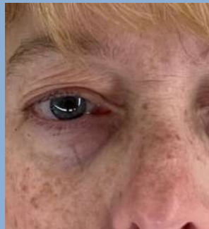
BEFORE IPL TREATMENT