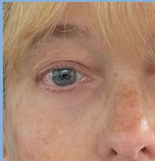
AFTER 4 IPL TREATMENTS