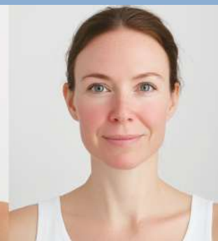
REDNESS REDUCTION POST 4 IPL SESSIONS