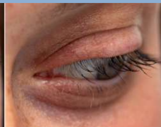
EYELID TELANGIECTASIA (INFLAMED BLOOD VESSELS BEFORE VS. AFTER IPL)